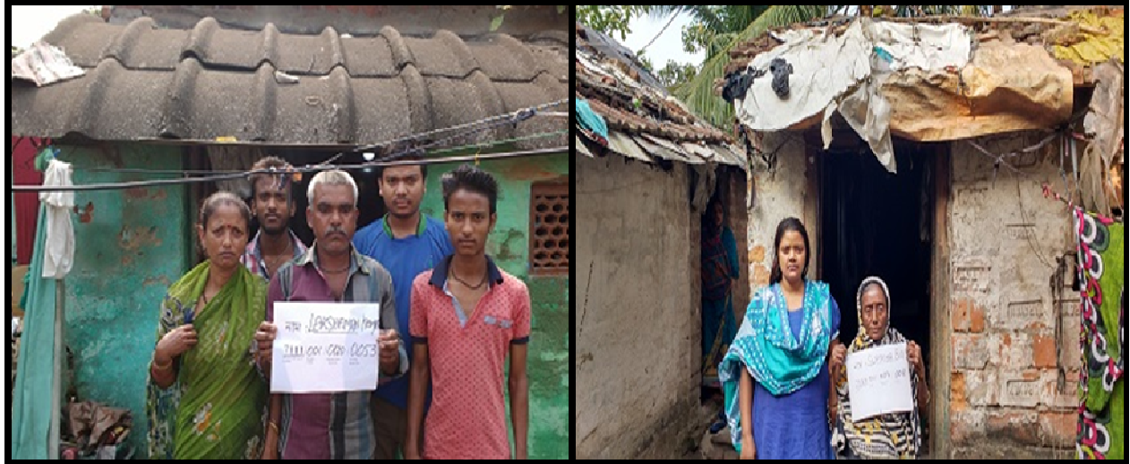
Beneficiaries in front of their existing dwelling unit