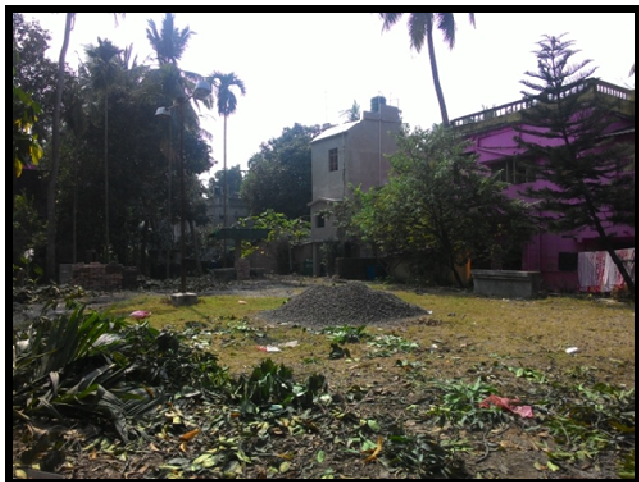
Present view of the places where parks are being developed