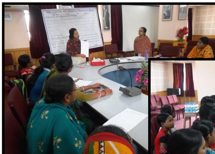
Training of SHG members