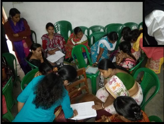
Training of SHG members