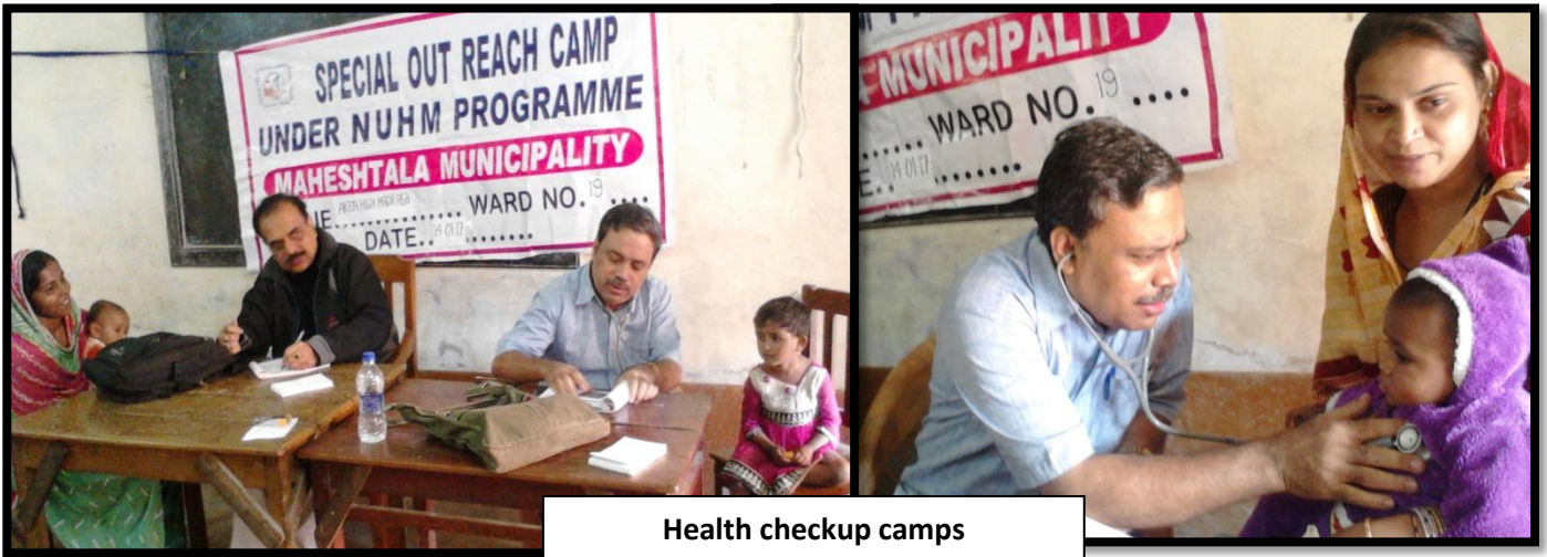
Health checkup camps