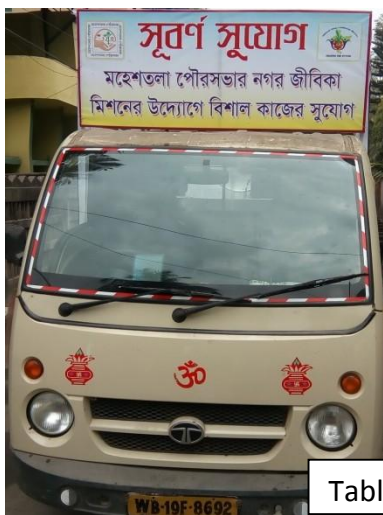
Tableau of CLC