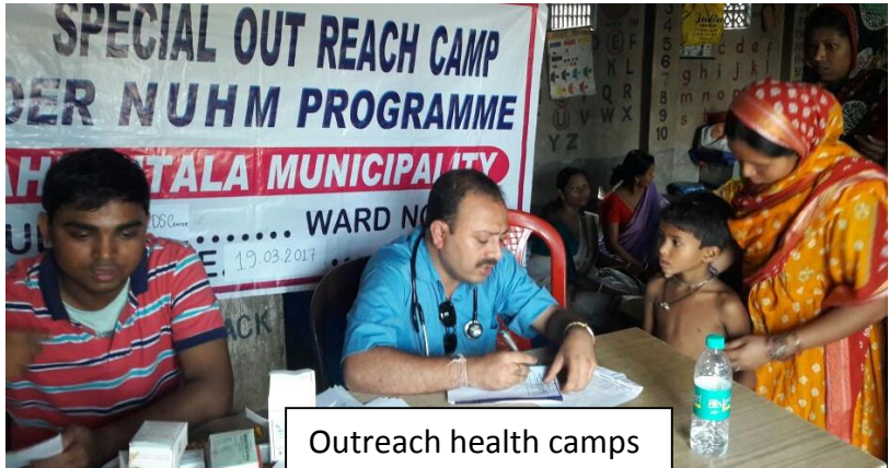
Outreach health camps

Qualified doctors and nurses were present in the camps to support the whole process. Around two hundred beneficiaries attended were there in the camps.